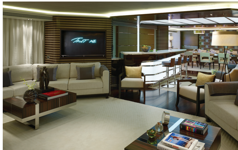
Top image: The revolutionary Fast Displacement Hull Form, designed in 3D with Dassault Systèmes' solutions allows Galactica Star to perform more efficiently over a wider range of speeds than any other yacht in her class.